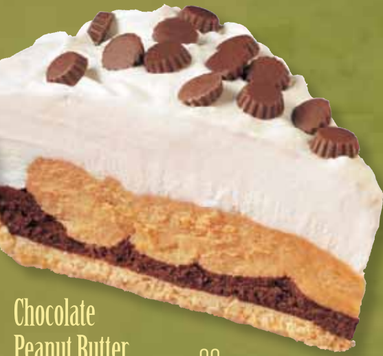
Chocolate Peanut Butter OO

The most tender, flaky crust generously filled with a layer of rich dark chocolate filling. Topped with whipped cream and beautifully garnished with a centerpiece of chocolate curls. 10", 36 oz.