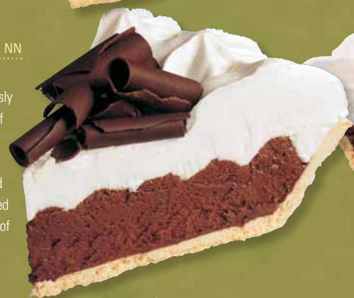
French Silk NN

Rich, creamy custard is loaded with toasted coconut in this incredibly indulgent pie. An absolute delicious dessert that will bring out the coconut lover in anyone! 10", 27 oz.